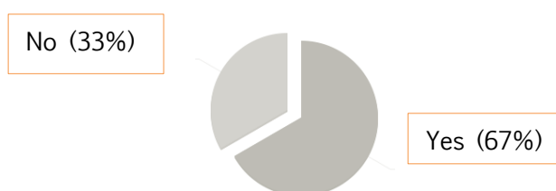
Figure 3. Students’ assessment of teachers’ point of view (N = 18).

The impact of a few teachers’ negative views is thus clearly perceptible in students’ assessments, and the above proportions show that 33% of students had heard their teacher(s) utter negative remarks. These views need to be taken into account, especially since they are by and large based on genuine concern for the quality of the training students receive. Some teachers were indeed concerned that use of MT might affect terminological or document research competence. Further investigations are indeed needed to make sure that MT does not interfere with any other fundamental competences in translator training.