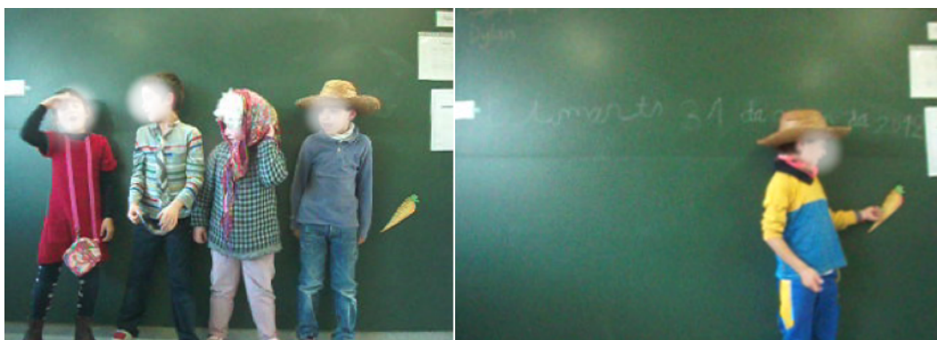
Figure 11. Students represent The Big Carrot

Once the initial rubric was modified and the improved rubric was used and tested in class, it was decided that this last rubric was appropriate for the research purposes and it was then used throughout the rest of the project for this particular activity. Following these four first sessions, this assessment system was established as a part of the teaching and assessment cycle for this class and activity. Rubrics proved to be a reliable system which ensured fair and continuous assessment and that showed proof of students’ performances according to the observations made for this particular activity. In order to double-check the reliability of the rubric, a complementary activity was carried out to ensure its validity in activities other than “Mr. Camera”. This activity was called “The enormous Carrot” and it consisted in a small theatre play of a story that had been previously worked in class for several sessions (see figure 2 for more information).