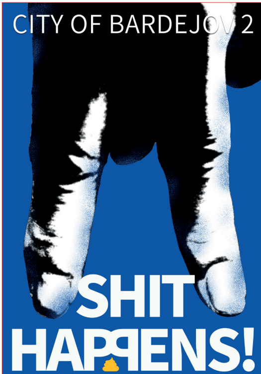
Figure 1. Designer A: Qiang Gang (with permission from the designer)